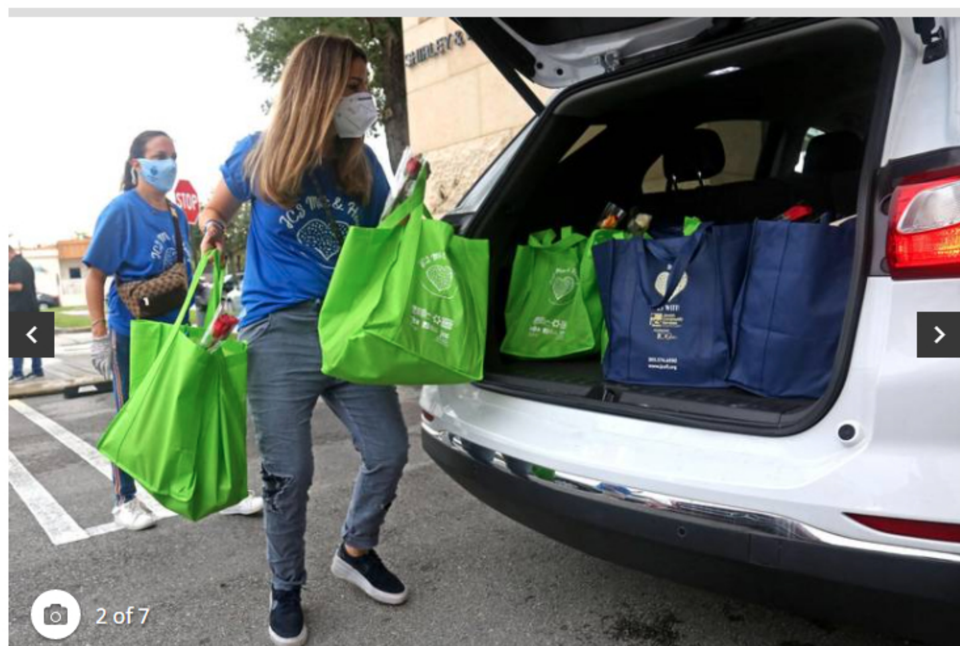
Jewish Community Services of South Florida and over five hundred volunteers provide much-needed connections and deliver 560 food gift baskets to homebound seniors in the community at the Annual Rosh Hashanah Milk & Honey event at the Michael-Ann Russell Jewish Community Center in Ojus, Florida, Sunday, September 13, 2020.

Because of the pandemic, volunteers picked up pre-assembled holiday baskets to make door-to-door deliveries.