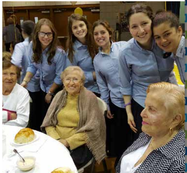
Students from area schools serve lunch and participate in Two's Company luncheon celebrations.

662 homeless clients, referred from eight homeless shelters in Miami-Dade County, benefited from JCS' comprehensive employment services including job counseling, direct job placement, day labor training and vocational training, to help them obtain work.